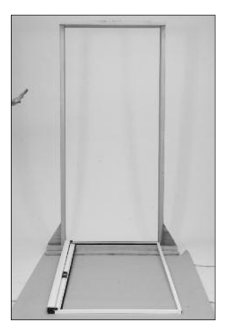
Diagram 9 - Engage all Four Corners of the Frame