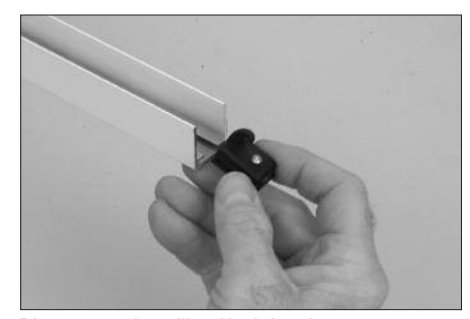
Diagram 5 - Installing Hook Latch