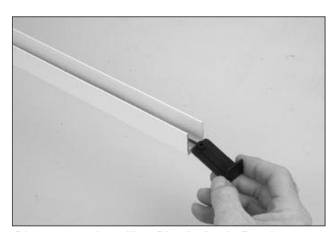
Diagram 6 - Installing Plastic Angle Brackets