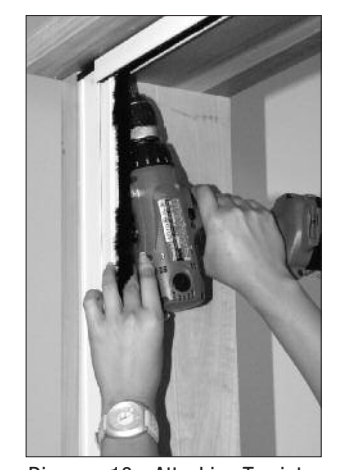
Diagram 10 - Attaching Top into Header