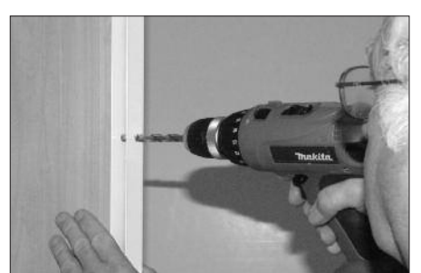
Diagram 13 - Prepping Side Jambs for Surface Mount Installations