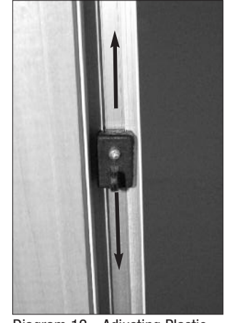
Diagram 12 - Adjusting Plastic Hook Latch