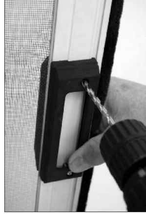
Diagram 11 - Attaching Pull Handle