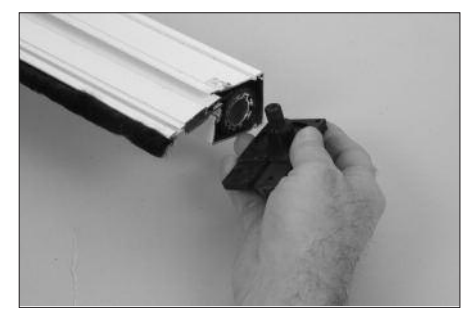
Diagram 3 - Installing End Cap