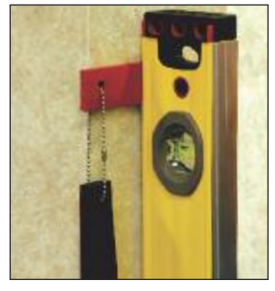
CAT. NO. PLF1