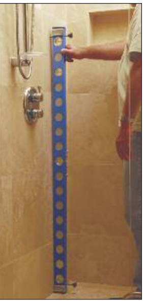
CAT. NO. PPL10

method of establishing the distance a wall is "out-of-plumb" from top to bottom. This figure is necessary for many types of glazier installations, specifically when laving out storefront and shower installations. CRL engineers took this idea, then redesigned and improved the original concept, resulting in the CRL Plumb Perfect. The end design is a simple, "one-person" tool that can be quickly extended to the correct height, trued to plumb, and then, with a twist of the scale locking knob, you can extend the scale to read the distance "out-of-plumb" the wall is from top to bottom.