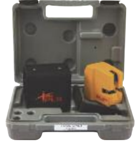
CAT. NO. PLS3