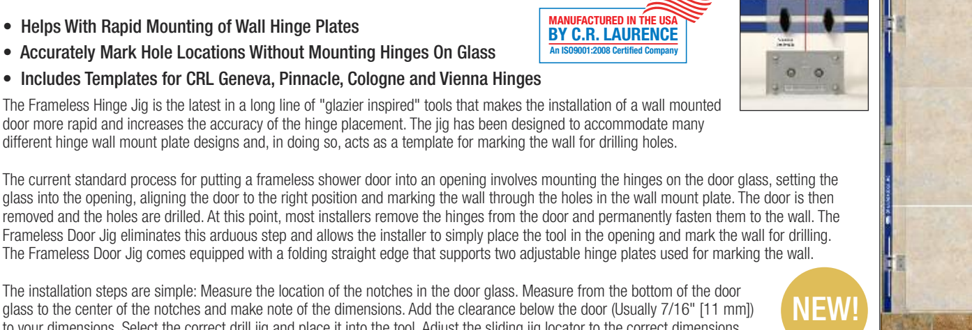
CAT. NO. FHJ1

crl-arch.com C.R. LAURENCE COMPANY crlaurence.com usalum.com