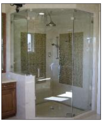
CAT. NO. UV282