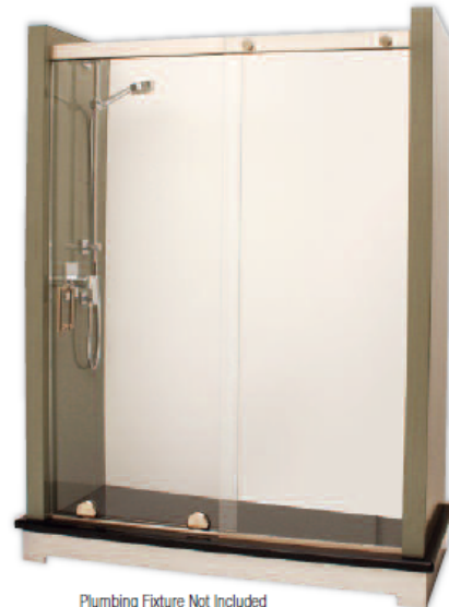
Plumbing Fixture Not Included