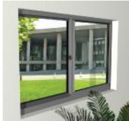
Series 8200 Horizontal Sliding Window

The Series 8200 Horizontal Sliding Window is available in block or fin frame designs. Along with the entire range of commercial grade U.S. Aluminum Windows, the 8200 Series is designed for smooth operation and durability. The 4-½” deep frame matches many building conditions such as entrances and storefronts. The thermally insulated frame accepts 1” glazing. Available accessories include mulling bars, subsills, head, and jamb channels.