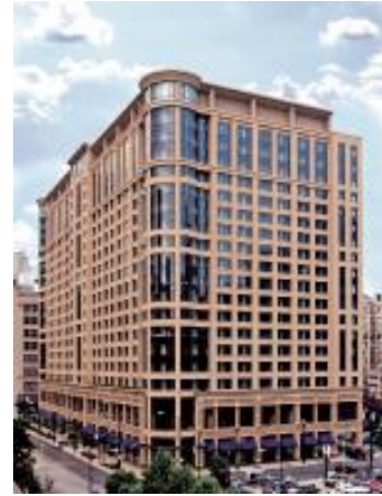
Series 7600 Concealed Vent Window

The Series 7600 Concealed Vent Minimal Sight Line Window utilizes durable stainless steel four bar hinges and cam locking handles. It's perfect for use in storefronts, curtain walls, and ribbon walls. Similar to the Series 7500 in some respects, the 7600 passes Miami/Dade large missile impact protocol 201, 202, and 203. For use with 1" glazing, the 7600's U Factor ranges from .56 to .34. This durable window is built-to-last with reinforced crimped corner construction.