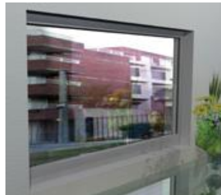
Series 8100 Fixed Window

The Series 8100 Fixed Window complements the Series 8000 and 8200 Windows. The 4 ½" deep frame matches many building conditions such as entrances and storefronts. The thermally insulated frame accepts 1" glazing. Available accessories include mulling bars, subsills, head, and jamb channels.