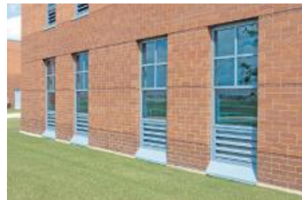
Series 7500 Concealed Vent Window

The Series 7500 Concealed Vent Window is a minimal sight line operable window ideal for use in storefronts, ribbon walls, and curtain wall openings. When the vent is closed it seals to the frame with Santoprene bulb gaskets that ensure air-tight seals. As with the 7200, 7300, and 7400 Series, the 7500 is built-to-last with reinforced crimped corner construction. The 7500 Series is also available in hurricane and blast resistant models.