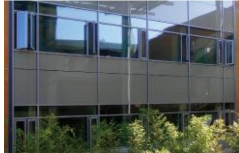
Series 7200 and 7300 Windows

The Series 7200 and 7300 Windows have 2" sight lines, and are dry glazed with E.P.D.M. elastomeric interior wedges. They are available in projected, fixed or casement styles suited for hospitals, schools, and institutional buildings. They are built-to-last with reinforced crimped corner construction, proven four-bar hinges, butt hinges, roto operators, friction adjusters, and stop limit arms.