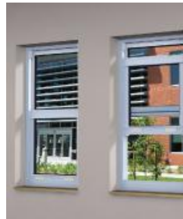
Series 8000 Single Hung Window

The Series 8000 Single Hung Window is available in block or fin frame designs, and uses a Class 5 balance for super-smooth well-balanced operation. The 4 ½" deep frame matches many building conditions such as entrances and storefronts. The thermally insulated frame accepts 1" glazing, with extruded pulls at the interlock and bottom rail, and a self-locking latch.