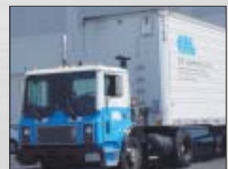
On the Road to You