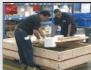
Packaging and Crating