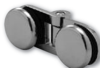
Cat. No. HYDH180 180° Glass-to-Glass