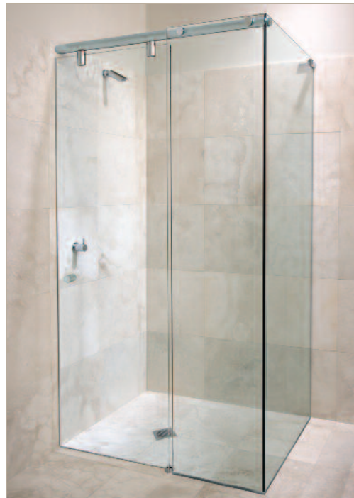
90 Degree Wall-to-Glass Installation Uses our 180 Degree Standard Kit plus a 90 degree Wall-to-Glass Accessory Kit