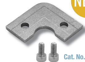
Cat. No. HYDH90