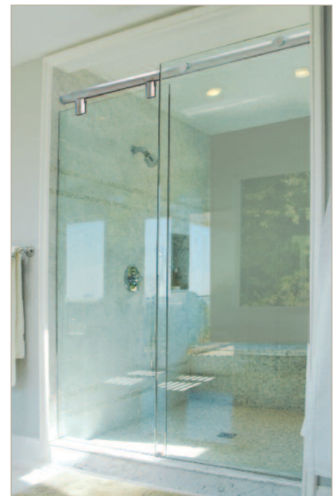
180 Degree Wall-to-Wall Installation Uses our 180 Degree Standard Kit