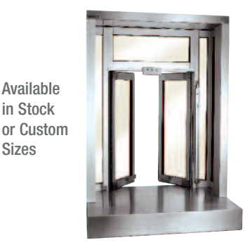
Projected Manual Model (Viewed from Clerk's Side) BFW2DU