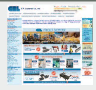
· Access to All CRL Products Through Their Easy-to-Use A to 7 Product Index