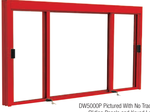
DW5000P Pictured With No Track Under Sliding Panels and Keyed Locks BFW2A